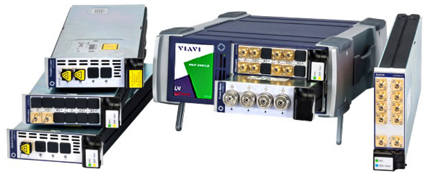
MAP-200 LightDirect Family of modules

The mBBS-C1 module, as part of the MAP-200 family, is an Ethernet or GPIB modular instrument that can be directly managed from your PC-based automation system. A member of the LightDirect Family of MAP-200 modules, the mBBS-C1 can be deployed in the compact MAP-220C 2-slot chassis or the larger 3 and 8 slot rack-mount chassis systems (MAP-230B or MAP-280). Alongside many other modules, such as amplifiers, precision attenuators, power meters and spectrum analyzer; the MAP-200 is the ideal, modular photonics test platform for 100G+ test applications.