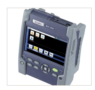
For more fiber testing and certification capabilities, combine the Certifier40G with one of the market-leading VIAVI fiber testers, such as the T-BERD/MTS-2000 and OLTS-85P