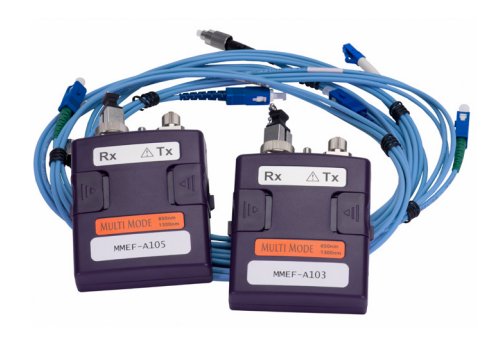
Append model number with -NA, -UK, -EU, -AU for regional power cords. Multimode (encircled flux) modules

Copper kits ship with all adapters and cords for testing links and channels to CAT6A/Class EA. Class FA adapters are available. The mainframe tests to beyond 2000 MHz and is CAT8 ready.