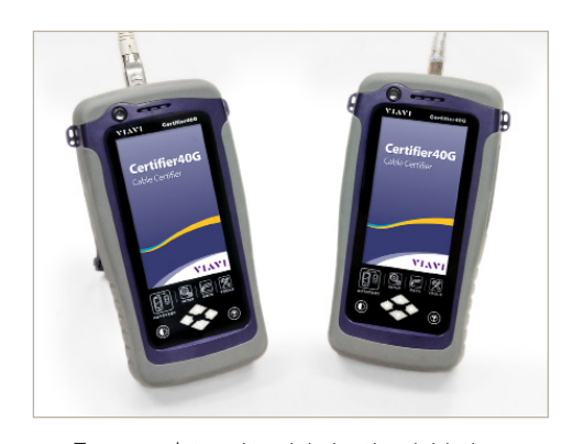
Two complete units minimize time initiating, naming, and saving results